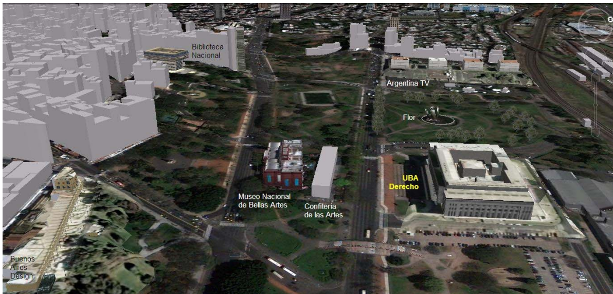
View of the site